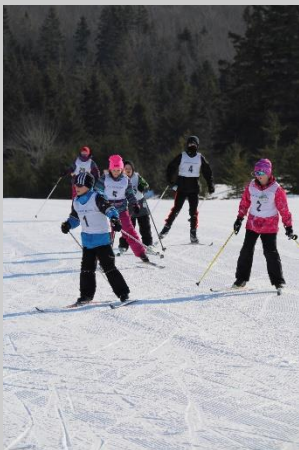
Biathlon Bears is a program for boys and girls aged 8-14.